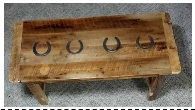
Big Creek Work Project July 5-7